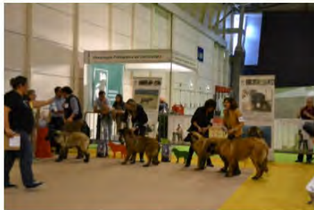
Puppy Class - Male - 1st: Gaio do Vale do Juiz, 2nd: C'Hulk da Casa Redonda, 3rd: Quietos do Cabeço do Seixo, 4th: Cashmir da Quinta da Liria.