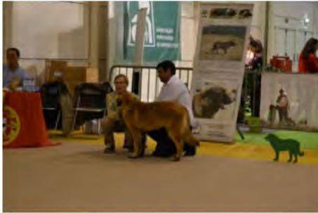
Baby Class - Male - 1st: Copper do Casal do Lethes.