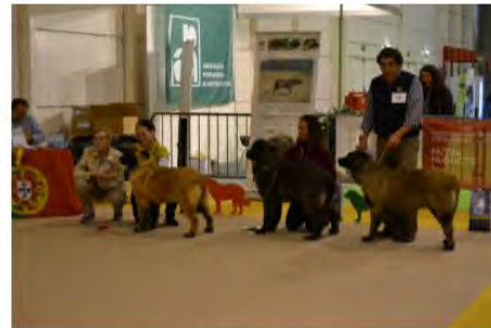
Puppy Class - Female - 1st: Rainha da Casa de Lôas, 2nd: Party da Ponta da Pinta, 3rd: Salsa do Vale do Juiz, 4th Maya da Casa das Thuyas.