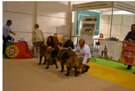
Veterans Class - Female - 1st: Mesopotania da Ponta da Pinta, 2nd: H'Orquidea dos Montes Herminios.

I hope you enjoy viewing some of the photos from the day. There was a few classes I missed because I was out getting some of our dogs ready or our friends dogs or I was caught up chatting away, I have to say it isn't easy being photographer at these events as there's always so much do to in between.