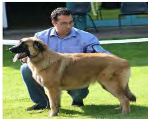
Tara da Quinta do Ganhão