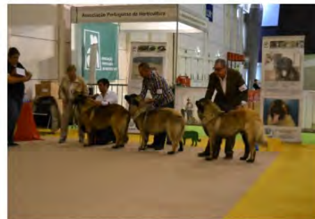
Intermediate Class - Male - 1st: Belchior do Casal do Lethes, 2nd: Mimo da Quinta da Liria, 3rd: Amor Meu de Santo Quintino.