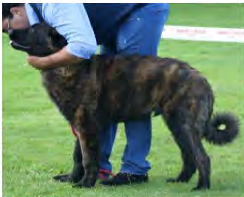
Eros da Quinta do Ganhão

I participated in a show in Portugal where I met a few breeders, specially Silvia Capitão from Canil Quinta do Ganhão. It was from her that I brought two puppies with me in 2015, a bitch called Tara and a dog called Eros.