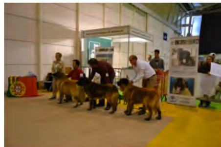
Veteran Class - Male - 1st: Trovão II, 2nd: Eragon da Casa de Lôas, 3rd: Smach da Casa das Thuyas.