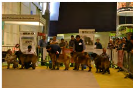
Open Class - Male - 1st: Bisconde do Casal do Lethes, 2nd: Onix da Casa de Lôas, 3rd: Konde do Vale do Juiz, 4th: Simba da Varanda dos Pastores.