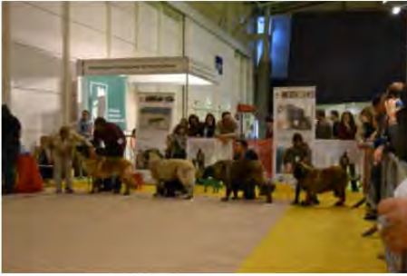
Junior Class - Female - 1st: Quikka da Casa de Lóas, 2nd: B'Pandora da Casa Redonda, 3rd M'Pipa do Cabeço do Seixo, 4th: Pipa da Casa das Thuyas.