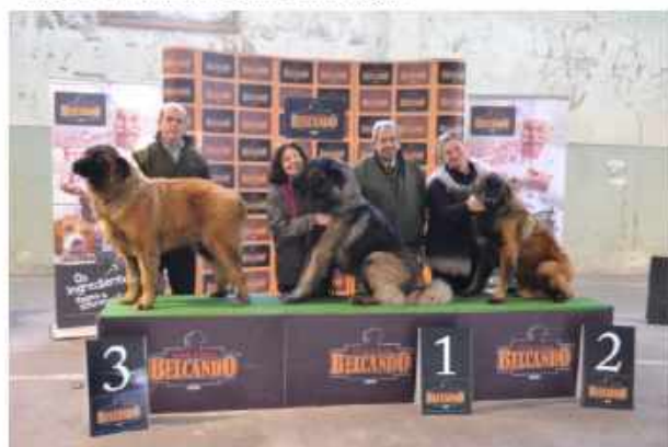
Classe Juniors/ Junior Class - Machos/ Males