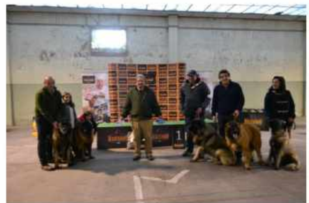
Classe de Grupos de Criador/ Breeders Group Class