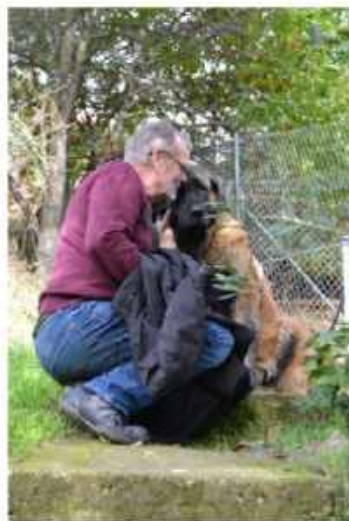
Canil Quinta da Liria - Esperanca Dias