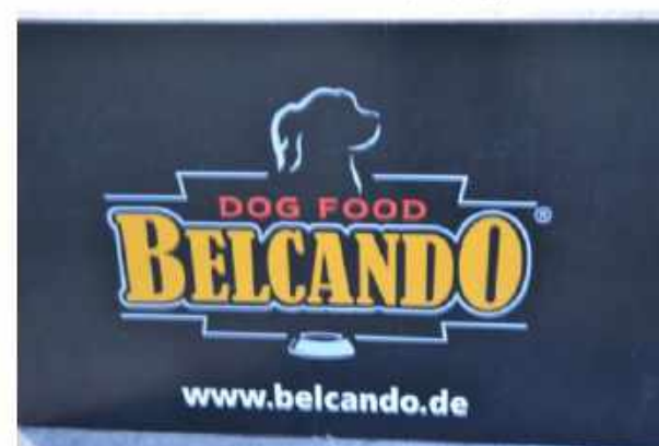
Classe de Campeoes/ Champion Class - Machos/ Males