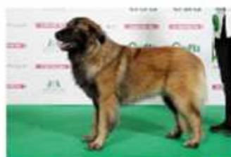
PORT CH ODI DA CASA DE LOAS EM BAMCWT (IMP PORT)