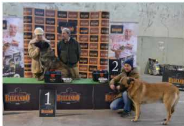
Classe Aberta/ Open Class Machos/ Males