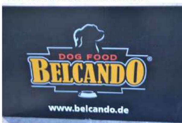
Classe Intermedia/ Intermediate Class - Machos/ Males