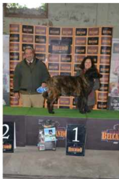
Melhor Cachorro/ Best Puppy