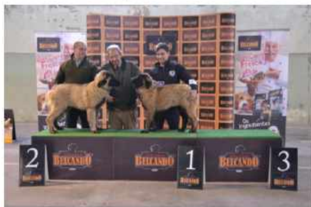
Classe de Bebés/ Baby Class