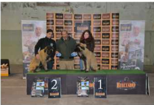
Melhor Bebe/ Best Baby