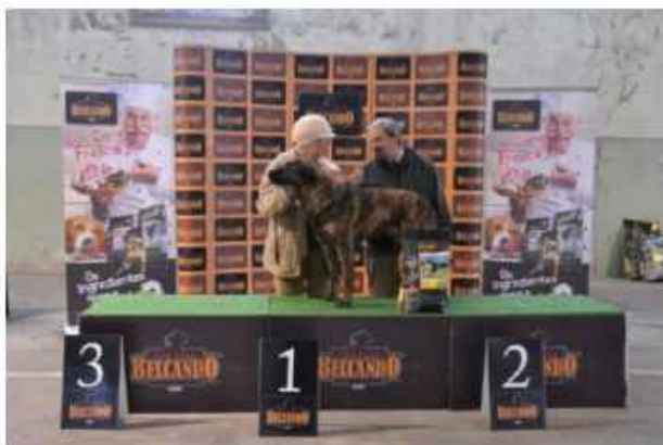
Classe Aberta/ Open Class - Femeas/ Females