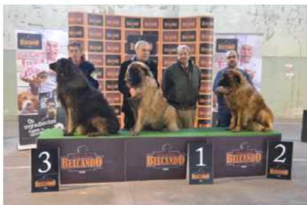
Classe Aberta/ Open Class - Machos/ Males