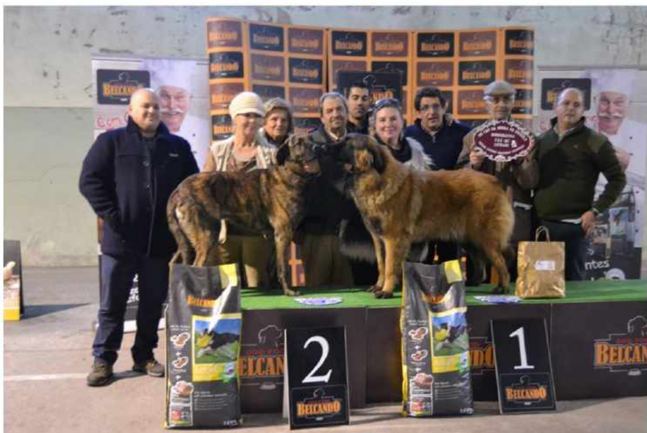
Melhor Exemplar da Exposicao/ Best In Show

18. Monge das Terras D'Cister PLW08, PMW08, JE08, JP09, VPW16, CH(PT), VLV16, VCH(PT)