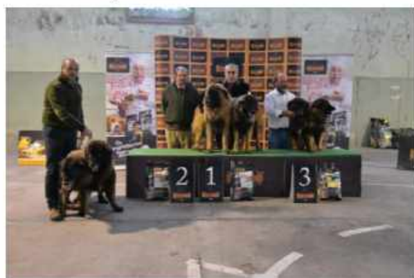
Classe de Pares/ Brace Class