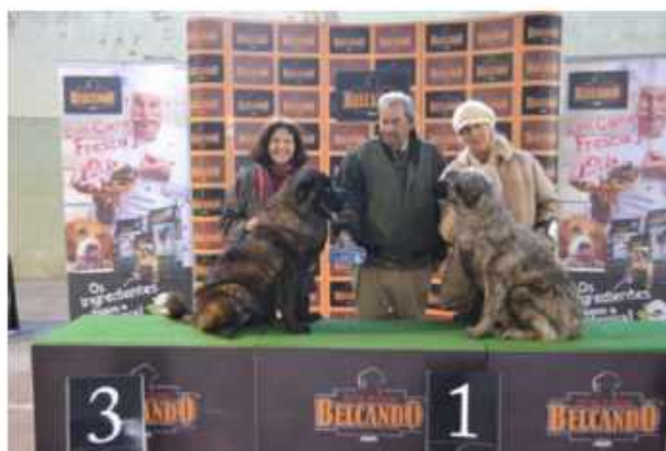
Classe de Cachorros/ Puppy Class