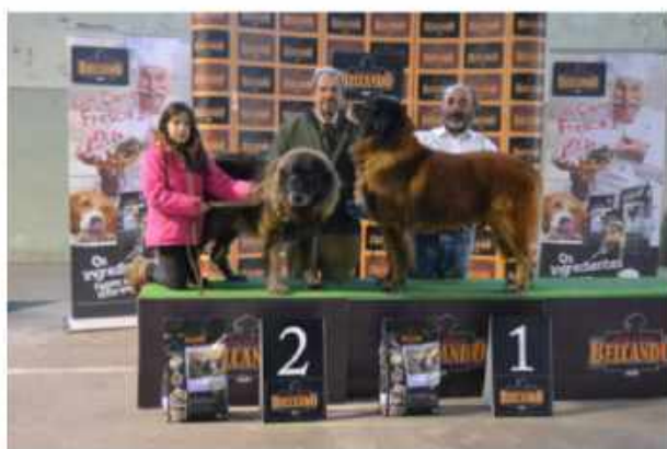
Melhor Veterano/ Best Veteran

18. Monge das Terras D'Cister PLW08, PMW08, JE08, JP09, VPW16, CH(PT), VLV16, VCH(PT)