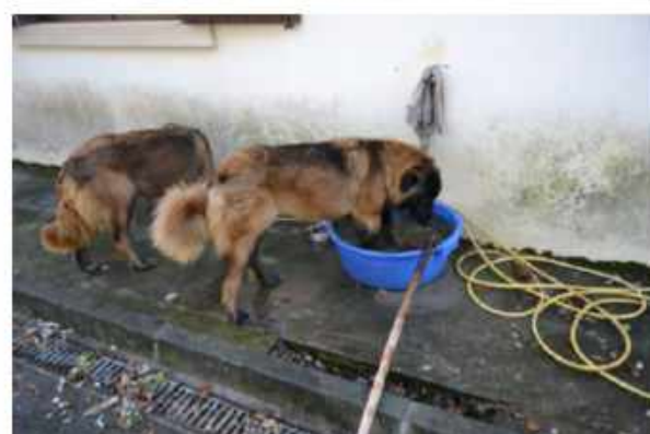
Out and about